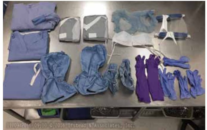
PPE used to reprocess one flexible endoscope