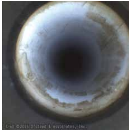
Inside a colonoscope suction/biopsy channel showing scratches and brown staining