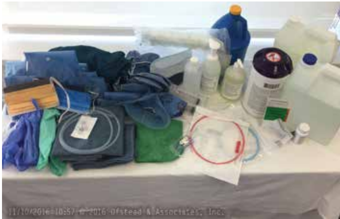
Materials used to reprocess one endoscope