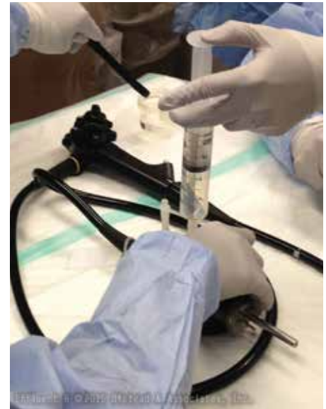
Two technicians conducting an ATP test of a colonoscope biopsy port