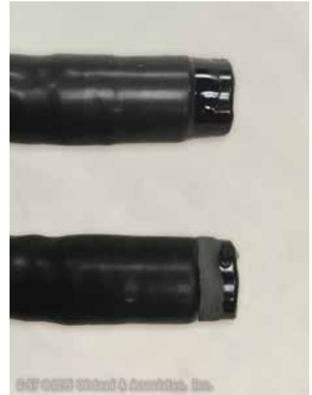
Distal ends of two gastroscopes (top one intact; bottom one damaged)

To examine inside ports and channels, it is necessary to use a borescope. These tiny endoscopes allow technicians to view internal surfaces using lighted magnification. It is important to use borescopes of correct dimensions (diameter and length) for the endoscopes being inspected. 2 Careful inspection can identify damage or debris that could impact patient safety or procedural success.