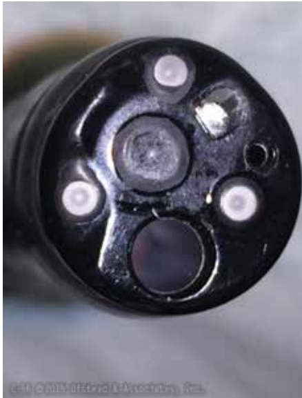
Distal tip of a colonoscope with a scratched and cloudy lens