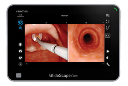
GlideScope® Core™ 15

Configure your GlideScope® video laryngoscopy system to the unique demands of your clinical setting. From hospital settings to surgery centers and EMS, find the option that suits your needs.